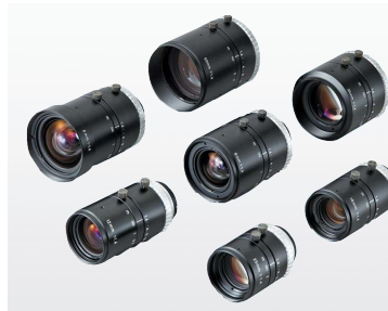
SV-H Series for 2/3-inch image sensor