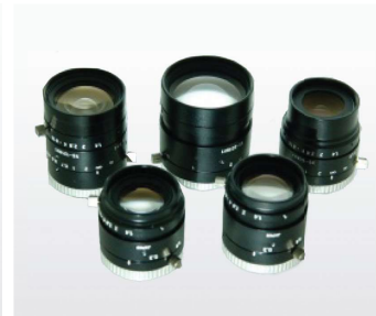
V5-H1 Series for 1-inch image sensor