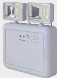
D KC04/6W D KC03/8W