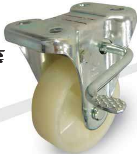
666 NPA RIGID BRAKE

In Compliance to Japanese Standard Specification SERIES 180 - 800 KGS