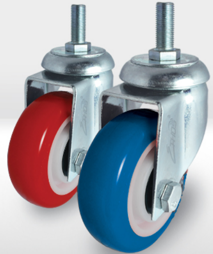
UBY PU Blue Available on request