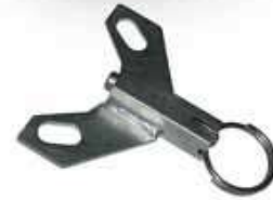
Option: PLUNGER Directional-Lock