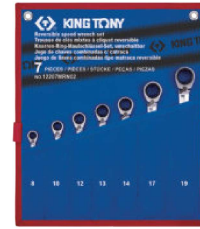
► Teton pouch bag