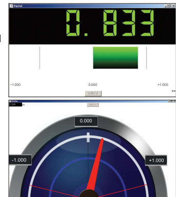
Image of companion software