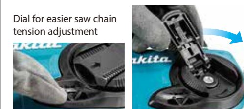
Dial for easier saw chain tension adjustment