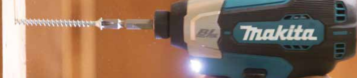
Bit is option