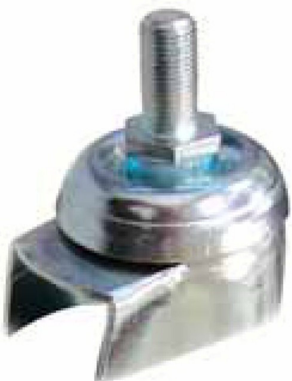
Table: Various threaded stem fittings available on request