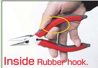
Inside Rubber hook.

3 Even if it is used downward, the hook will prevent it from slipping down from your hand.