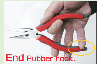
End Rubber hook.

4 Hook will pass the force from your fingertip.