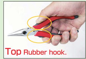
Top Rubber hook.

2 Even if oil is adherent, hook fits your fingertip.